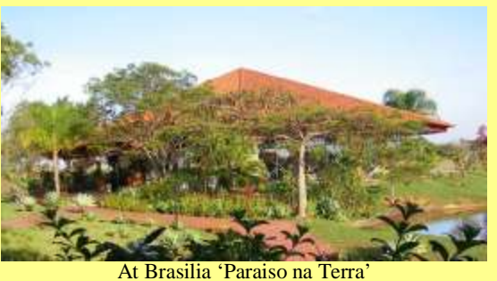
The building where the session took place

Remarkably also, the intervention of a young girl of 12 years who spoke in front of the senate for being the spokesperson of the young ones of her generation so that those in charge now leave them a land where life will be possible.